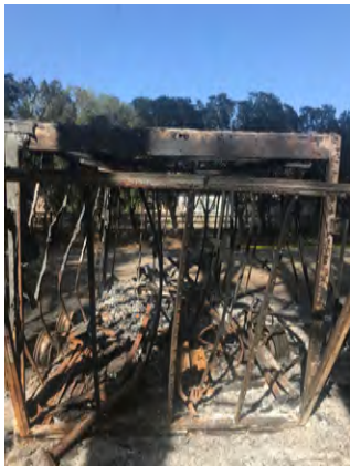
Nothing remained of the newly outfitted SBC-CDS trailer after the Holiday Fire.

We really didn't want to focus on the past in this newsletter. Most of our readers already know about the loss of our show trailer in the Holiday Fire, and have done their part to help replace it.