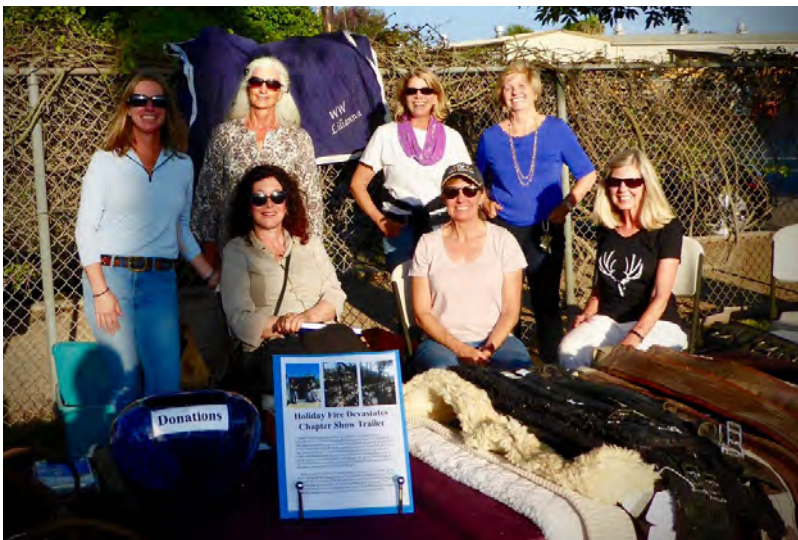
SBC-CDS chapter members browsed, sold, bought, and visited at the annual LPTR Tack & Tog Sale, held this year at the Santa Barbara Humane Society.

Thanks to all who donated, stored, cleaned, and priced these fun items, to those who staffed the sales tables, and to those who came to buy and visit with other chapter members and trail riders. It was a fun time, we made some much needed money, and what we didn't sell we donated to another worthy cause, Hearts Therapeutic Equestrian Center.