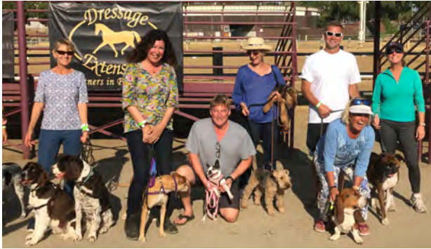
It wasn't just a horse show. Riders and volunteers also brought along their well behaved dogs!